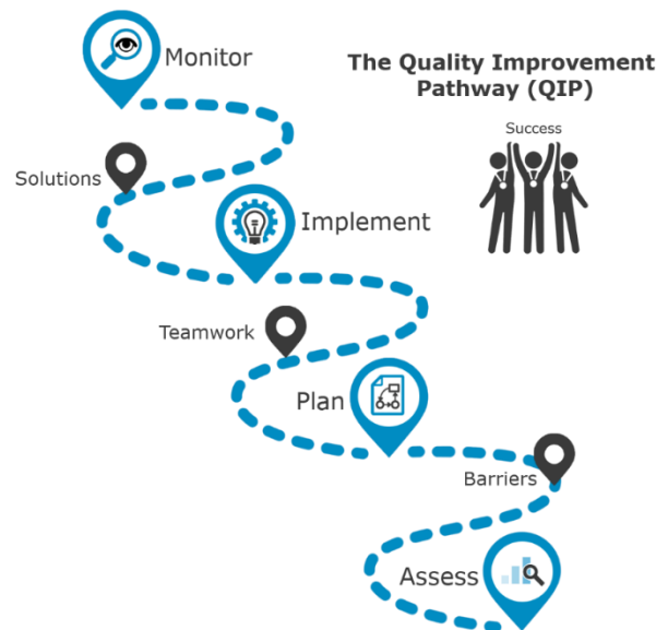
Figure 2. The Quality Improvement Pathway

FQHC participants will be guided through a quality improvement (QI) pathway on this project, as illustrated in Figure 2 . Qsource will assist with an initial practice assessment to determine how practices are currently capturing pneumococcal immunization data and reviewing current workflows, orders or clinical decision support rules for adult immunizations. Qsource will assist the practice with monitoring current pneumococcal immunization rates to determine which interventions will be most effective.