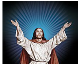
What the Bible Says About Money (Fascinating) Newsmax