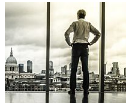
4 Billionaires Say: Something Big Coming Soon In U.S.A Stansberry Research