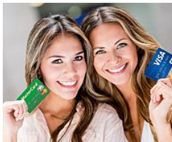
Unbelievable Deals Offered by Credit Cards for Those with Good Credit NextAdvisor