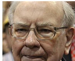
4 in 5 Americans Are Ignoring Buffett's Warning The Motley Fool