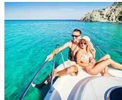
College Student Finds Market Trend; Increases Net Worth By Millions Money Morning Report Subscription