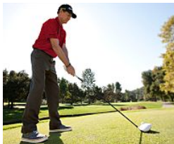
Classic golf mistakes amateurs make at the tee Hank Haney University